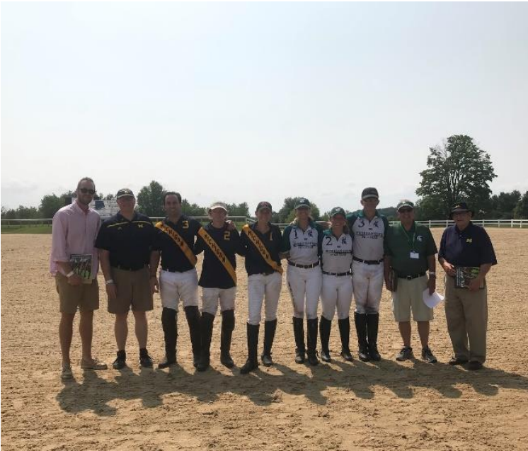
Michigan and Michigan States teams after the match.

We had another fantastic year of summer exhibition matches, with our most successful fundraising match yet! Taking place in Traverse City on the weekend following the Great Lakes Equestrian Festival, the Michigan Intercollegiate Polo Club and the Michigan State Polo Club faced off in a friendly fundraising rivalry match. This year's match took place on a lovely August day, with a large turnout of both Wolverine and Spartan fans.