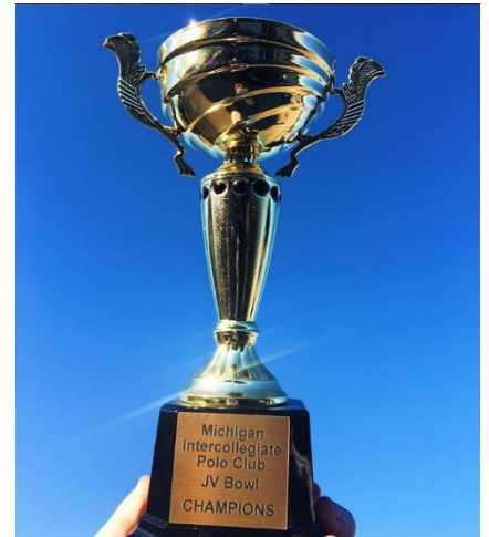
Right: The JV bowl trophy in all its glory!