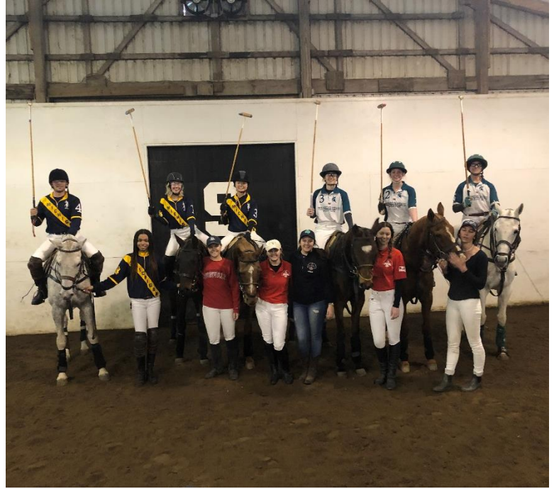
Post round robin team picture!