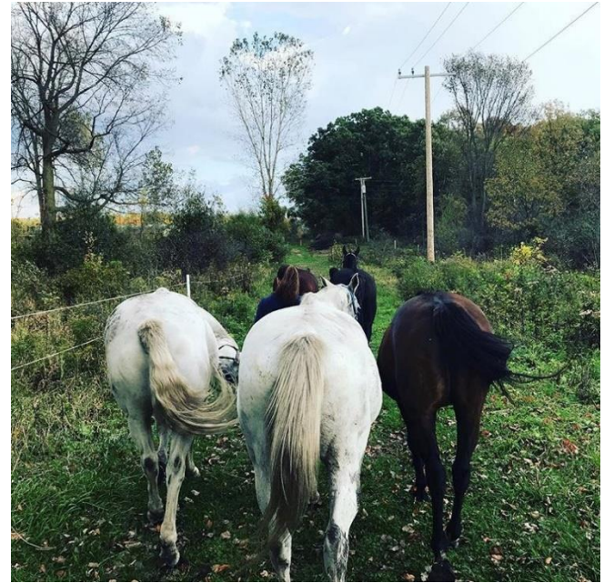
Our scenic walk taking our ponies back out to their pasture.